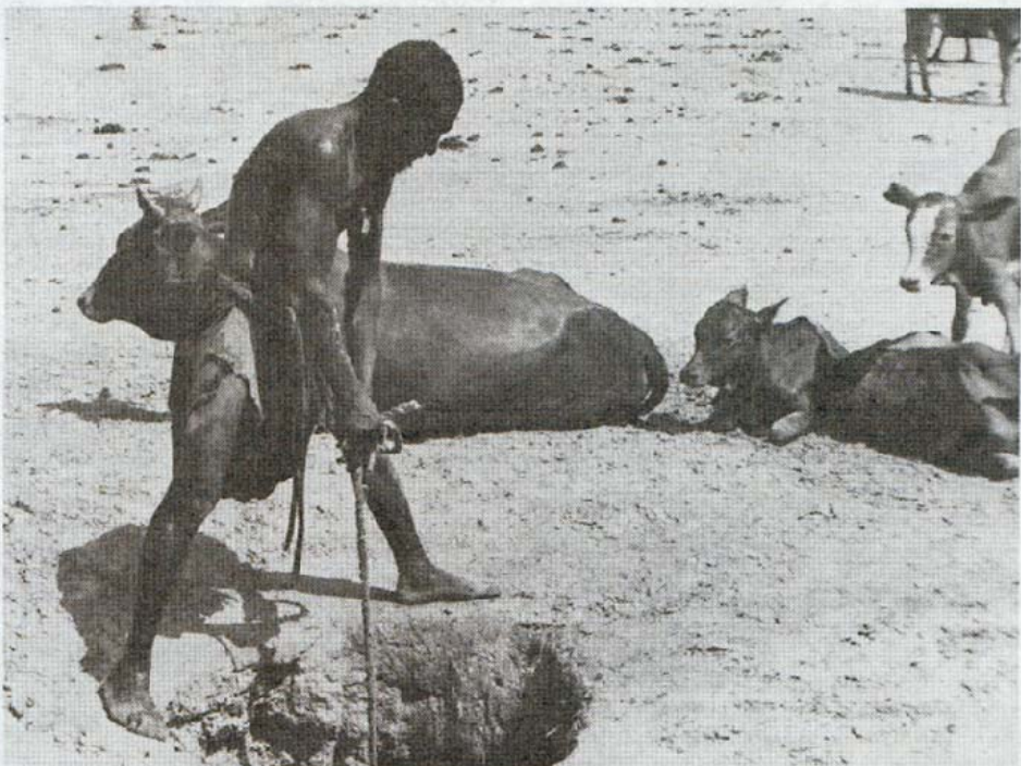
The labour of drawing water from the desert

In the heyday of the Roman Empire, the deserts of North Africa were its granaries. Drilling for sub-soil water can help reclaim the desert, but in the long term a natural water cycle must be re-established. And that means planting trees. Drilling for water in the sub-soil yields only short-term benefits which often lead to the region drying even further. There are deterrent examples of this from the USA, whilst there is evidence (from Italy, for instance) that selective re-afforestation produces undreamt improvements in climate. Dry springs forgotten for centuries flow